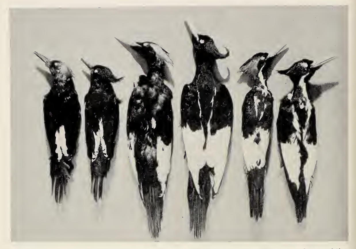
FIG. 7. From left to right are adult pairs of Magellanic Woodpecker ( Campephilus magellanicus ), Imperial Woodpecker ( C. imperialis ) and Ivory-billed Woodpecker ( C. principalis ). The male of each species is at the left, and the female at the right.

The Magellanic Woodpecker has a large white wing patch restricted to the inner web of the secondaries and the basal portion of the inner vane of the primaries; the primaries are never tipped with white. In contrast, the northern ivory-bills have white over the entire distal portion of all secondaries. and white progressively restricted from the inner to the outer primaries toward their tips and not their bases. This renders the flight pattern of these birds entirely different. Like Phloeoceastes guatemalensis and P. melanoleucos (see Figs. 8, 9) and the Pileated Woodpecker ( Dryocopus pileatus ), the Magellanic Woodpecker exhibits a single , anterior, white underwing patch, because the white in its flight feathers is continuous with that of the underwing coverts. The northern ivory-bills exhibit two white wing patches, an anterior patch formed by the white coverts, and a posterior white patch separated from it by the black bases of the flight feathers (see Tanner, 1942:2).